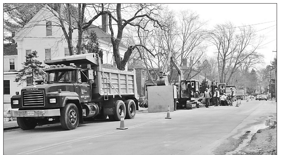
Kennebunk, Kennebunkport, Wells Water District coordinates new water main line installation with the Town to help complete Maine Street storm drain work before summer traffic arrives.

Look for our crews to be out doing shoulder work on Ocean Avenue and Wildes District Road this year. If you have any suggestions or see something we missed, please give us a call at 967-5728.