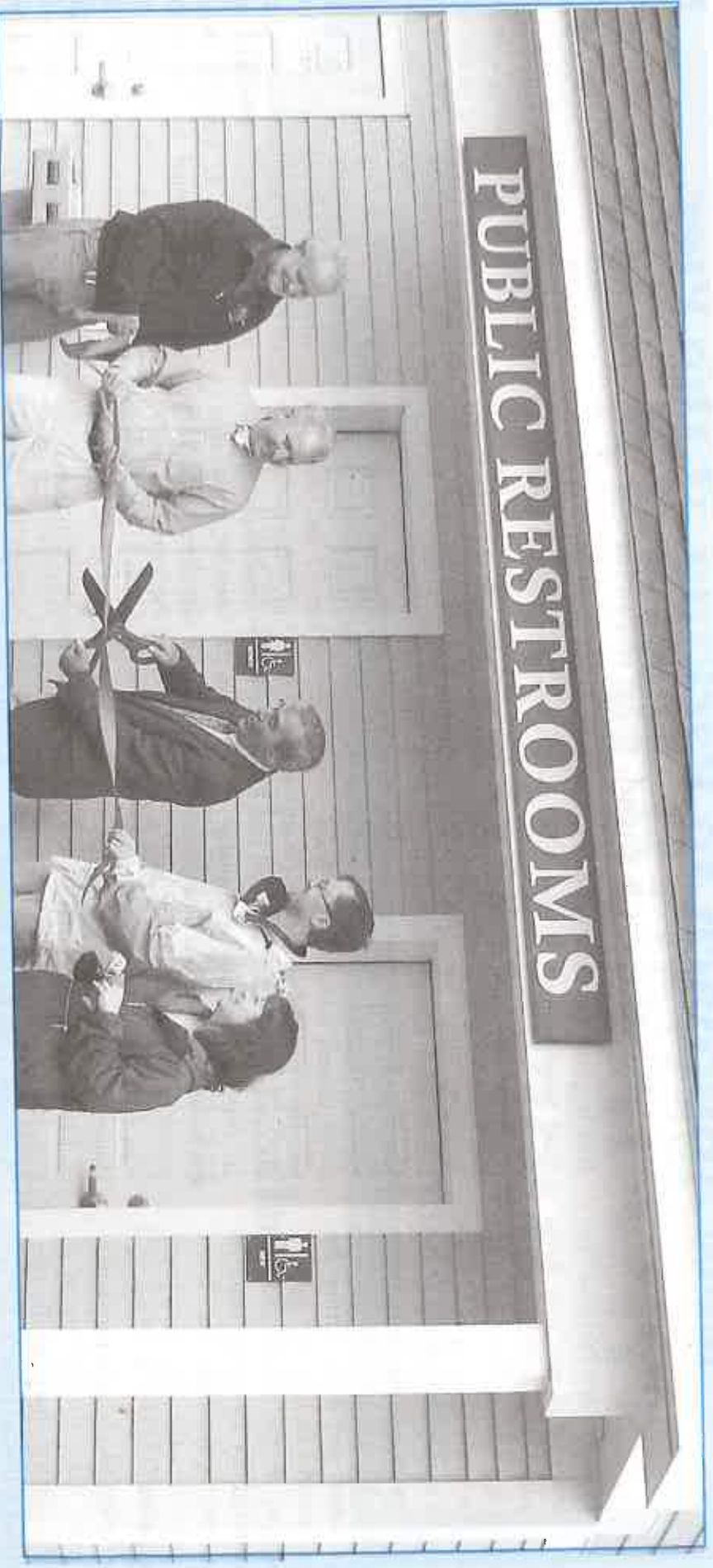
From all reports, the new public restrooms at Dock Square are well received by residents and visitors alike.