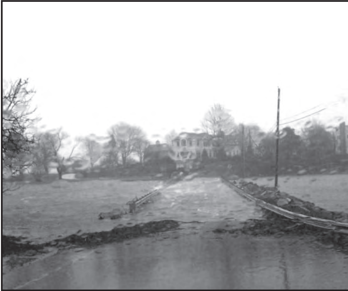
The causeway on Pier Road flooded during a spring storm. Never attempt to drive through flooded roadways!

The Kennebunkport Emergency Management Agency (EMA) maintains the Town's Comprehensive Emergency Plan and works with local, county, state, and federal officials to prepare for possible disaster situations. In an actual emergency, the EMA establishes an Emergency Operations Center and coordinates the community's response to the situation.