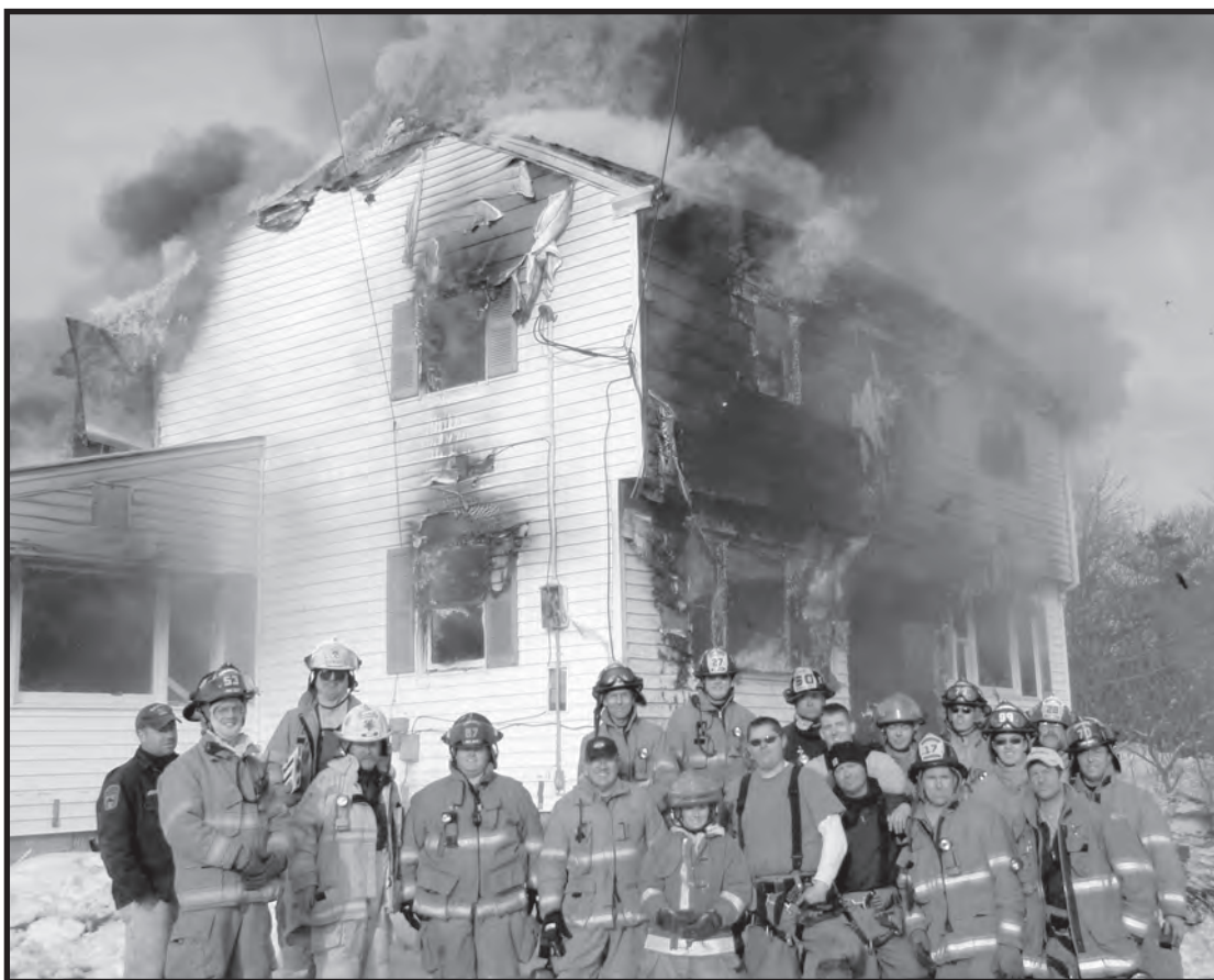
In Feb. 2011, Kennebunkport firefighters pose for a quick group photo during a training burn of a structure on Henchey Way at Goose Rocks Beach.

The Kennebunkport Fire Department consists of 80 volunteer members responding from the Town's four stations: Cape Porpoise, Goose Rocks Beach, Port Village, and Wildes District. We presently operate 12 pieces of fire apparatus, plus two small boats for water rescue.