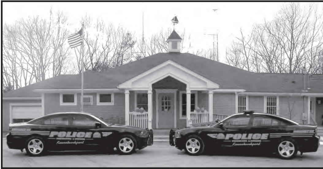
The new Dodge Charger police cruisers.

through its completion. The wind turbine will serve as an education piece for the Consolidated School as well as contributing its produced electricity to the Police and Communications Departments.