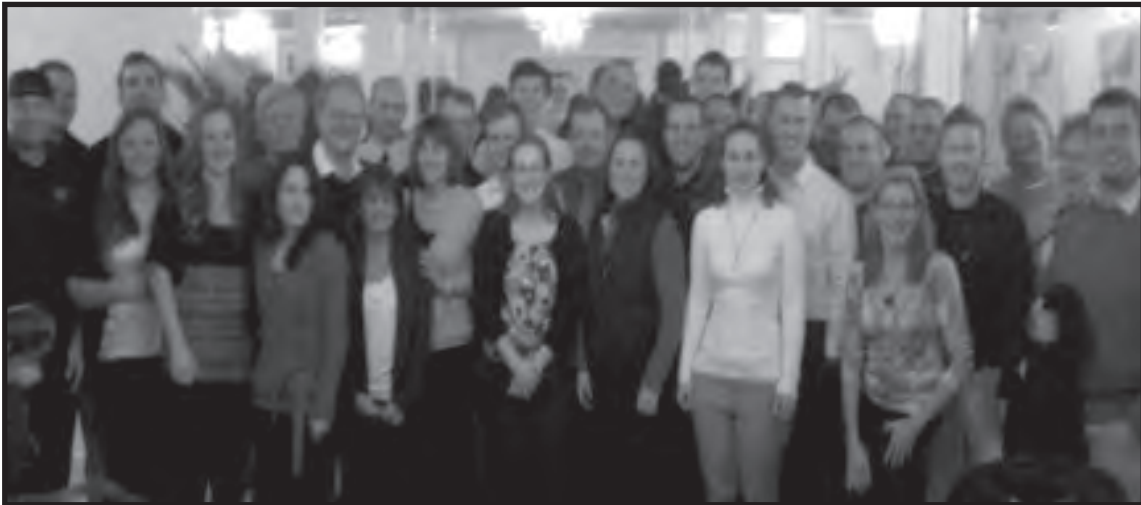
KEMS annual banquet in 2011.

President Vice President Secretary Treasuer Member Member Member Member Selectmen's Representative Crew Representative Bookkeeper