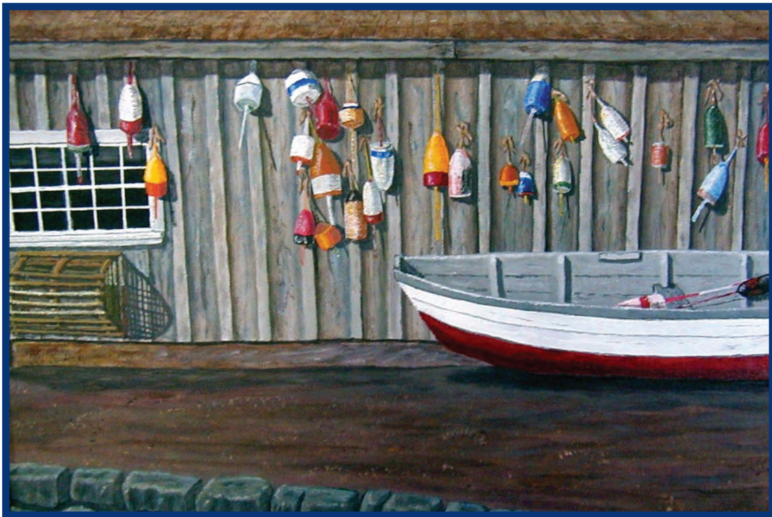
The Cape Porpoise Pier Lobster Bait Shack