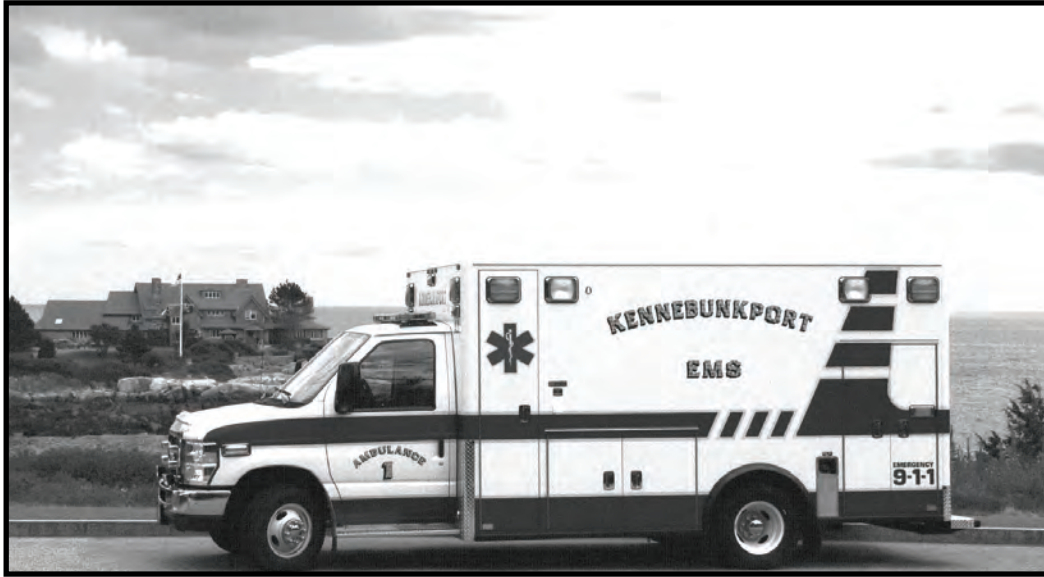
2010 Horton Ambulance

Kennebunkport Emergency Medical Services is a private, nonprofit, volunteer agency that provides emergency medical care to the Town of Kennebunkport. We also participate in mutual aid agreements with the Towns of Arundel, Biddeford, Kennebunk, and Wells. The ambulance is stationed at the Cape Porpoise Fire Station, where space is leased for the ambulance and crew quarters.