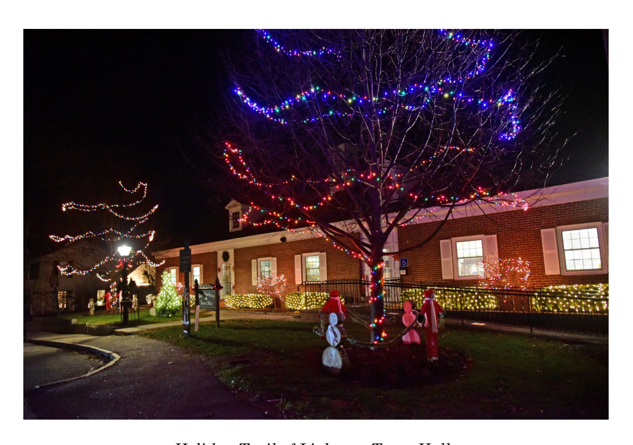
Holiday\ Trail\ of\ Lights\ at\ Town\ Hall