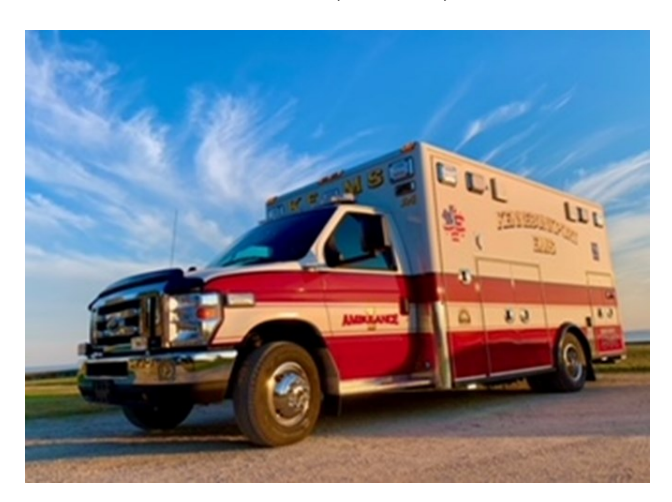
2020 Horton Ambulance

Kennebunkport Emergency Medical Services is a private, not-for-profit organization that provides emergency medical care and transport to the citizens and visitors of Kennebunkport. In addition to providing medical care for our community, we also participate in mutual aid agreements with the towns of Arundel, Biddeford, Kennebunk, and Wells. KEMS operates out of the Cape Porpoise Fire Station, where space is leased from the Atlantic Volunteer Engine Company for ambulance housing, office space and employee living quarters.