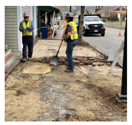
Sidewalk repairs—Ocean Avenue

Winter 2020 came to an early end mid-February as the Highway crew only had one plowable storm after February 19<sup>th</sup>. This allowed our crew to accomplish tree limbing on Goose Rocks Road from Log Cain Road to Whitten Hill Road. While our tree work was limited to the opposite side of the road from power lines, we were able to remove hazardous limbs that posed a danger over the roadway. Our mild winter also allowed us to complete street sweeping and get a jump on street line and crosswalk painting.