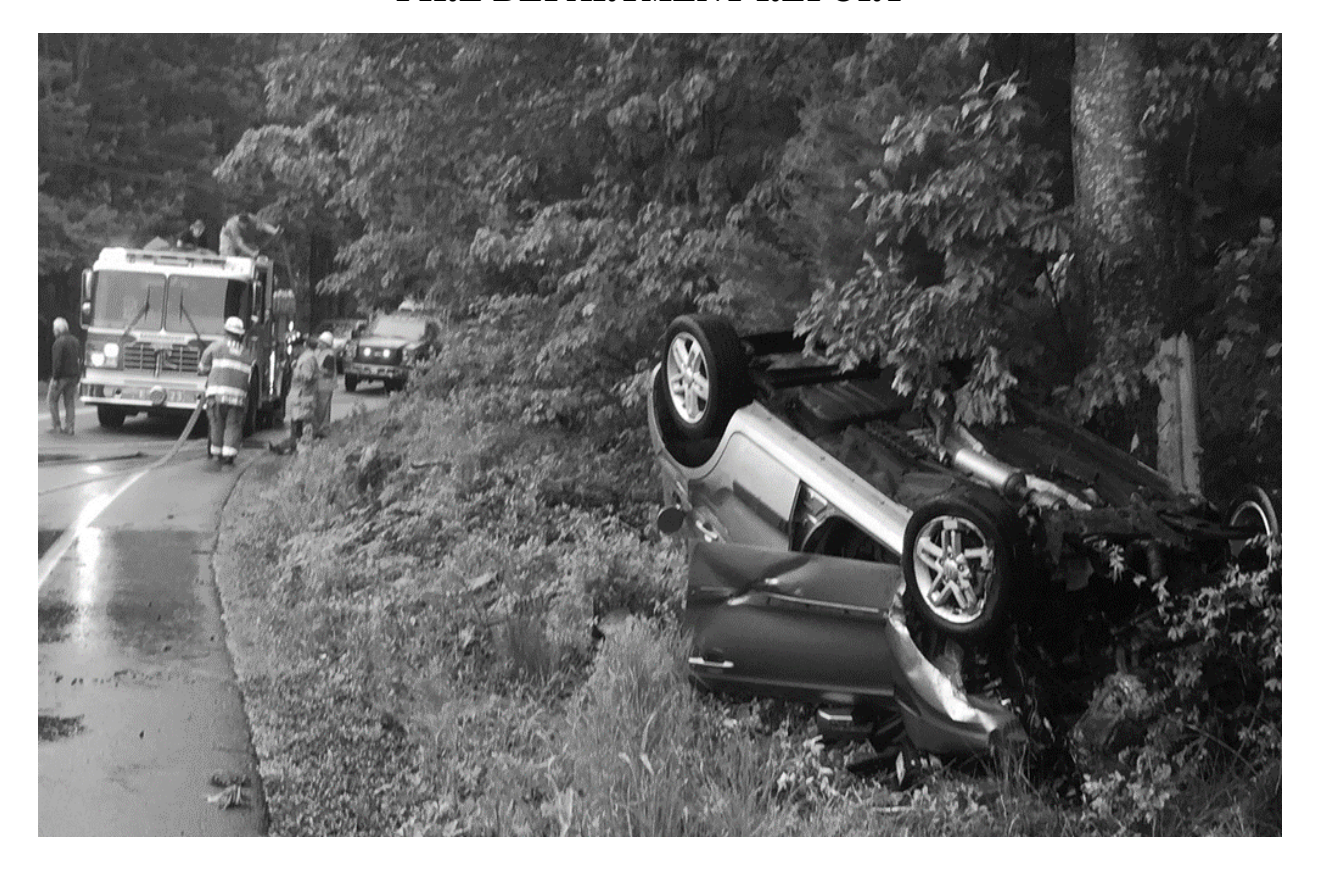
Kennebunkport firefighters pick up hose and equipment following an early morning motor vehicle crash on Mills Road in June 2020.

The Kennebunkport Fire Department consists of over 70 volunteer members responding from the town's four fire stations: Cape Porpoise, Goose Rocks Beach, Kennebunkport Village, and Wildes District. We presently operate 12 pieces of fire apparatus, plus two Zodiac rescue boats for water rescue.