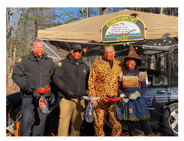
Halloween Trail of Treats

2020 was, well, 2020; but we feel that we had a successful year despite the challenges faced. At the beginning of the pandemic, we had to drop face-to-face programming and offer options in a fully remote setting. During this stint we were able to offer Tai Chi, Chair Yoga, All Levels Yoga, and a children's program. When we were able to return to our physical location, we provided 506 homemade Meals to Go for our seniors!