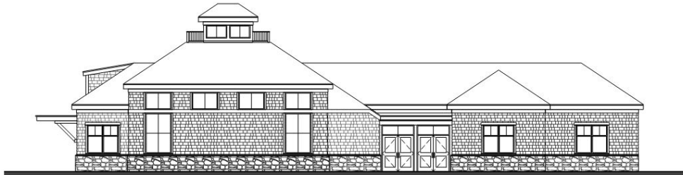
B PROPOSED SOUTH ELEVATION (PARKING) SCALE: 1/8" = 1'-0"