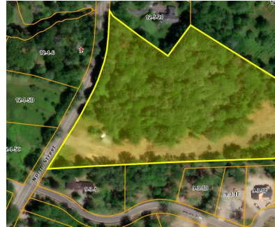
North Street Site – Preferred Alternative