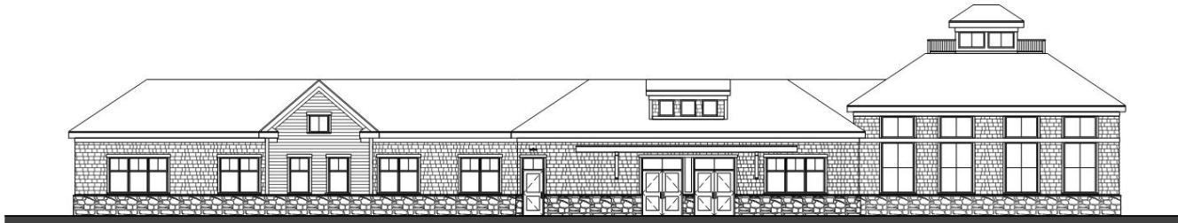
A PROPOSED WEST ELEVATION (NORTH STREET) SCALE: 1/8" = 1'-0"