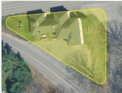
63 Wilds District Road