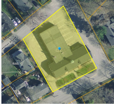
Existing Town Office